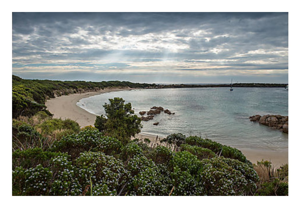
1 NOVEMBER 2021 KING ISLAND, TASMANIA

The Tasmanian Wilderness World Heritage Area is one of the largest conservation areas in Australia and one of the last expanses of temperate wilderness in the world. Located at the heart of the World Heritage Area, the Port Davey Marine Reserve is a unique protected waterway featuring a layer of rich red-brown tannin freshwater overlaying the tidal saltwater from the Southern Ocean. Port Davey is only accessible by foot, boat or light aircraft, preserving the pristine natural environment that is characterised by rugged coastlines with blowholes, caves and dramatic rock formations home to wildlife that includes the little blue penguin and Australian fur seal. If weather permits, guests will have the opportunity to explore the coastal environments and view the wildlife from our fleet of Zodiac®.