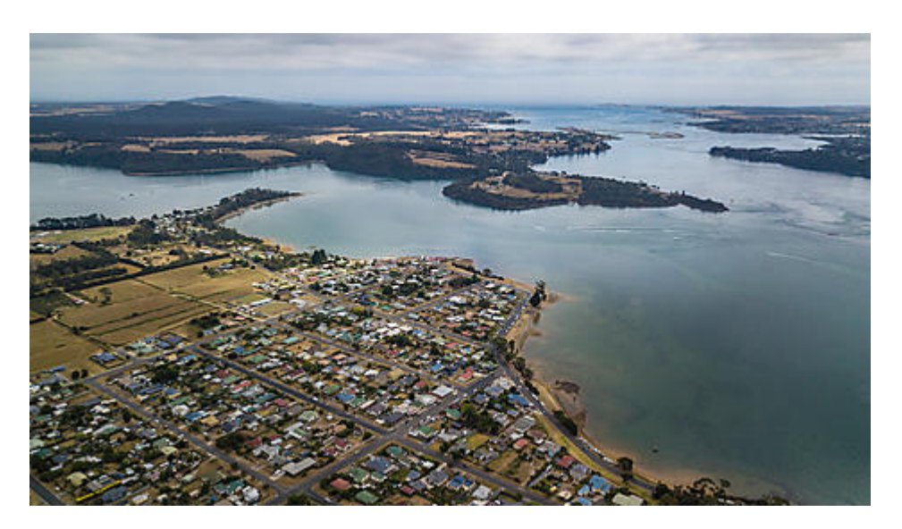
2 NOVEMBER 2021 TAMAR VALLEY, TASMANIA

museum and cultural centre in the town of Currie or to take a guided trail of the island's produce, culture, history, flora and fauna.