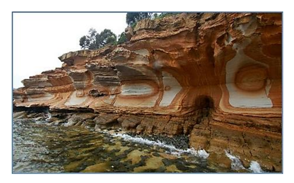
6 NOVEMBER 2021 MARIA ISLAND, TASMANIA

opportunity, and a place of leisure. Now it is one of Australia's most important heritage destinations, where the story of Australia's colonial history is written in stone and brick. Port Arthur was included in the National Heritage List on 3 June 2005 and is one of 5 World Heritage listed convict sites in Tasmania. Join your expedition team and local guides for an insight into Tasmania's tumultuous past.